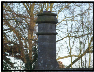
Panel on the back of the Barrows houses Chimney at the back of the church