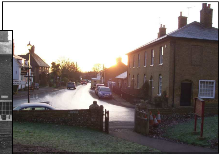
A View of the village from the church showing the Post Office on the corner.

Do you recognise these Borden 'landmarks'?